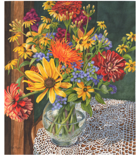
“Bouquet on Crochet,” watercolor