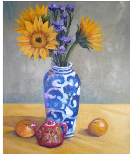
“Sunflowers in Chinese Vase,” oil